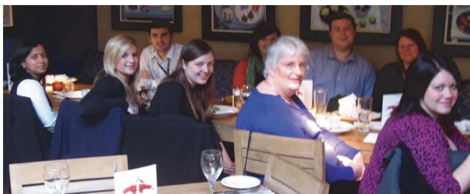
SCC Direct Payments Team

Work wise my wish is to provide a simple and straightforward Direct Payments system that meets the needs of the citizens of Surrey and for them to feel confident that if they have any points they wish to make about our service we will respond in a positive, constructive manner.